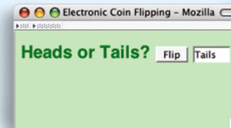
Figure 20.5 The JavaScript and image for the Electronic Coin-Flipping page.

<html> <head><title>Electronic Coin Flipping</title></head> <body bgcolor="#ccffcc" text="green"><font face="Helvetica"> <script language="JavaScript"> function coinFlip() { return Math.round(Math.random()); } function flipText() { if (coinFlip()==0) return 'Tails'; else return 'Heads'; } </script> <form name="eCoin"> <h2>Heads or Tails? <input type="button" value="Flip" onClick='document.eCoin.ans.value=flipText()'/> <input type="text" name="ans" size="5"/></h2> </form> </body> </html>