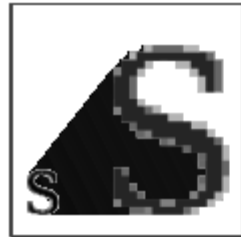
BITMAP .jpeg .gif .png