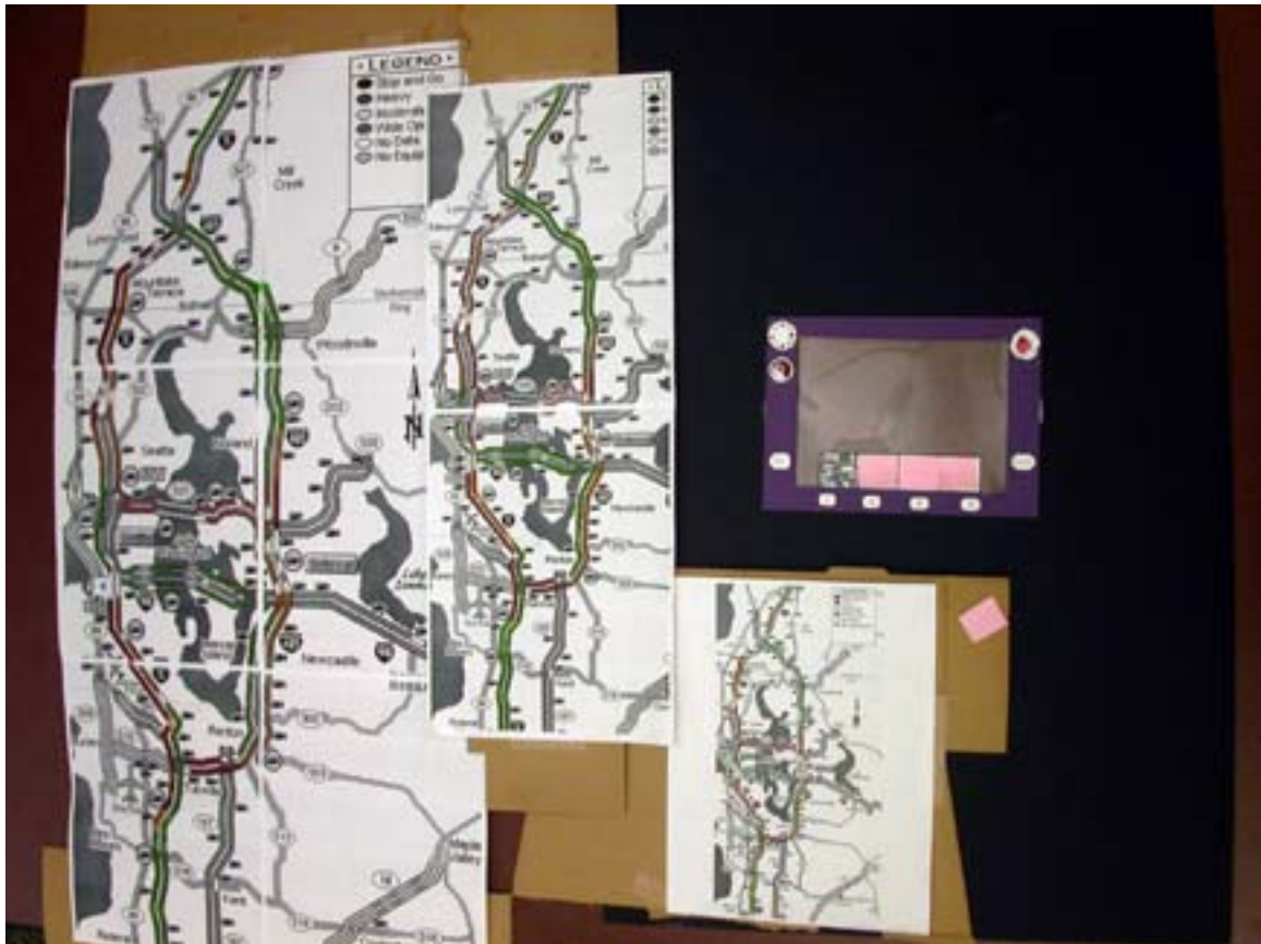
Figure 2: Low fidelity prototype (more detailed pictures in Appendix)

Transportation website. Icons were drawn on the map. The thumbnails of preset views were covered with Post-It notes and peeled off when the user set a preset. The buttons around the screen were made of rough cardboard. The ones that could turn, like volume, were secured with a thumbtack.