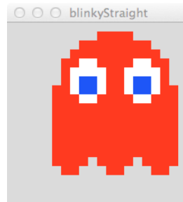
look == 1