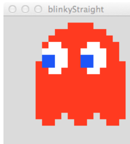
look == 0

where xpos , ypos are the pixel coordinates where Blinky should be drawn on the screen, and look is an integer variable with one of three values: 0, 1, 2 producing one of these three pictures: