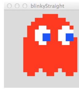
look == 2

By changing the parameters, we can move Blinky around on the screen and make it look different directions. If you didn't complete the assignment, use the Basic Form code provided.