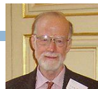
Sir Anthony Hoare

"Debugging is twice as hard as writing the code in the first place. Therefore, if you write the code as cleverly as possible, you are, by definition, not smart enough to debug it."