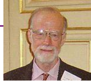
Sir Anthony Hoare

The first method is far more difficult.”