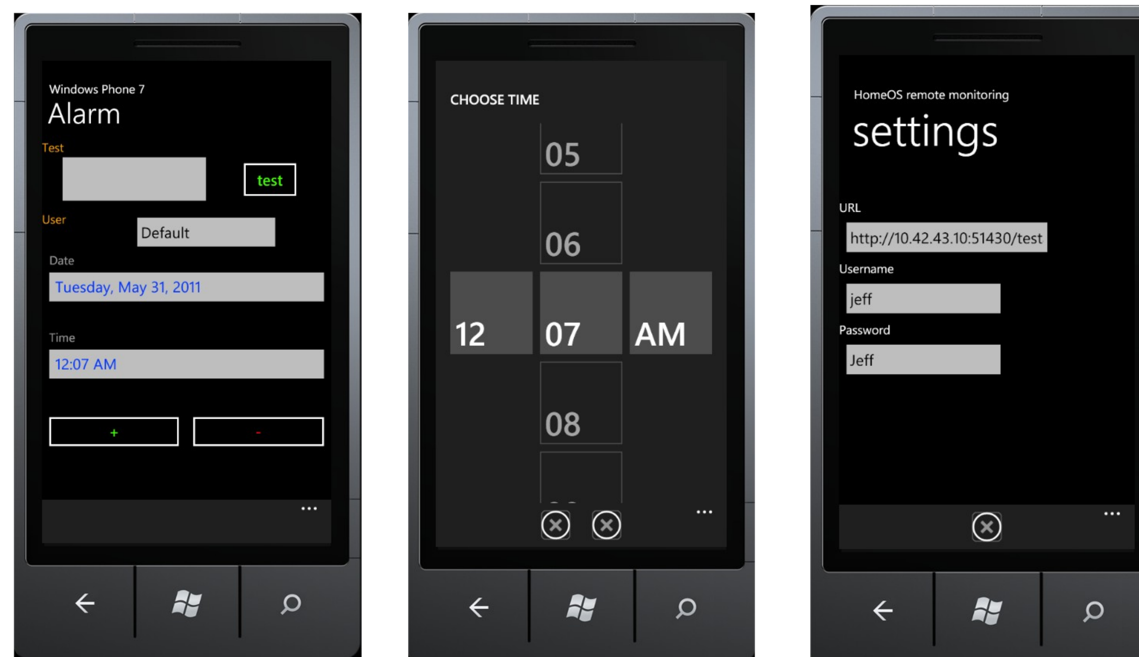
Main Menu | Alarm Setting Screen | Settings Screen

HomeOS does the actual storing of alarms and settings for our application, as well as adjustments to the alarms based on user-specified constraints. The methods of alarm execution are also carried out within HomeOS.