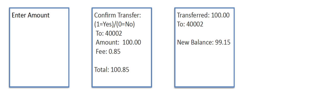
Figure 2: Three screens showing the multiple steps included in the process to send money to another person (from Left to Right). Each box will be one screen in the application. (5 to 7 out of total 7 screens).

UW-Pesa Documentation: For the implementation back end, you have to connect with the UW Pesa APIs.