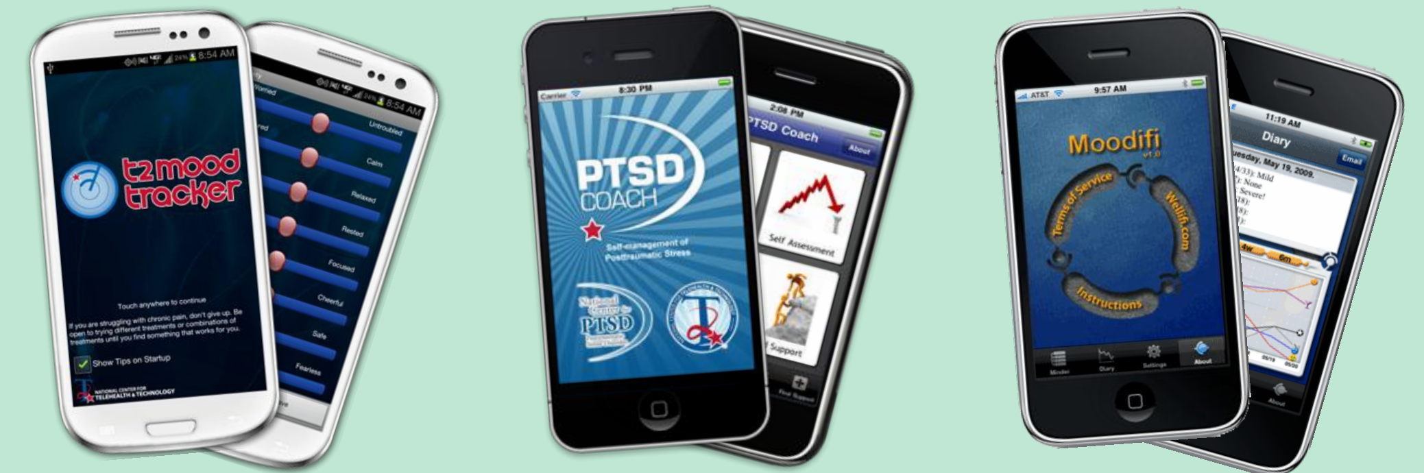
T2 Mood Tracker

Several mobile apps provide reminders, track progress over time, and/or do rudimentary troubleshooting.