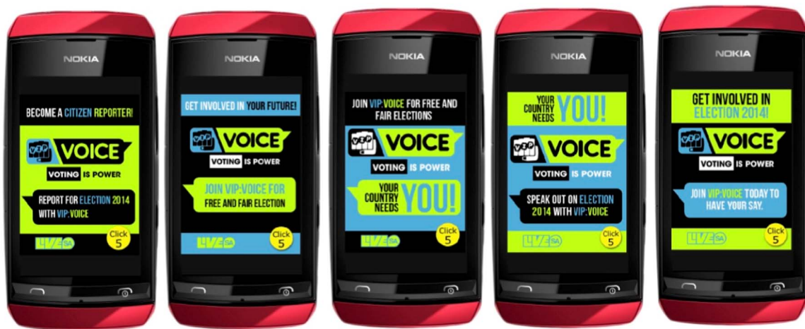
Fig. A1. Example splash screens for recruitment into platform.

In addition to these surveys, presented via drop-down menus, VIP:Voice tracked real-time shifts in political opinion and incidents of political activities. One set of questions, the “Activity” survey, asked about local political activities at three different times prior to election day, randomizing the day on which an individual received the survey. A second set of “Thermometer,” questions asked about voting intentions and party support. Users could complete surveys in any order, and failure to complete one survey did not preclude answering questions on others. Phase 2 required digital forms of engagement as all activities were limited to interacting with the platform. Of the 90,646 people registered, 34,727 (38%) completed the four demographic questions and 15,461 (17%) answered the demographic questions and one of the other four Phase 2 surveys. See also Ferree et al. (2017) for additional details.