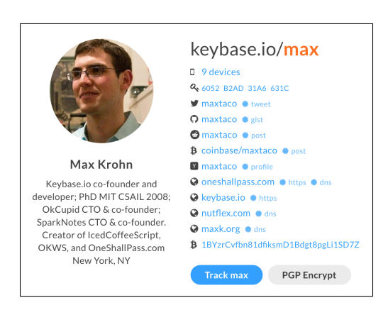
Figure 1. A Keybase profile, linked to the user's social media accounts.

Key distribution and verification is central challenge of encrypted email [11, 26, 31]. Users of PGP-based email