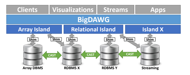
Figure 1: BigDAWG Architecture

Complex analytics are a must-have. Historically, business analysts interacted with BI tools, which are a non-programmer interface to relational analytics (e.g., COUNT, SUM, MIN, MAX, AVG with an optional GROUP BY). Increasingly analysts rely on pre-