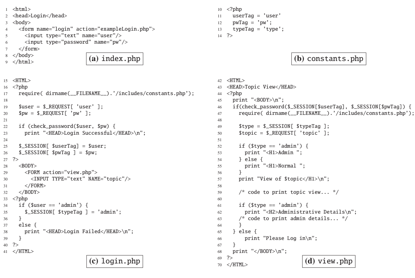
Fig. 4: Example PHP web application.

state, which will finally generate HTML exhibiting the fault as is shown in Figure 5(a). Thus, finding the fault requires a careful selection of inputs to a series of interactive scripts, as well as making sure updates to the session state during the execution of these scripts are preserved (I.e., making sure that the execution of the different script happen during the same session).