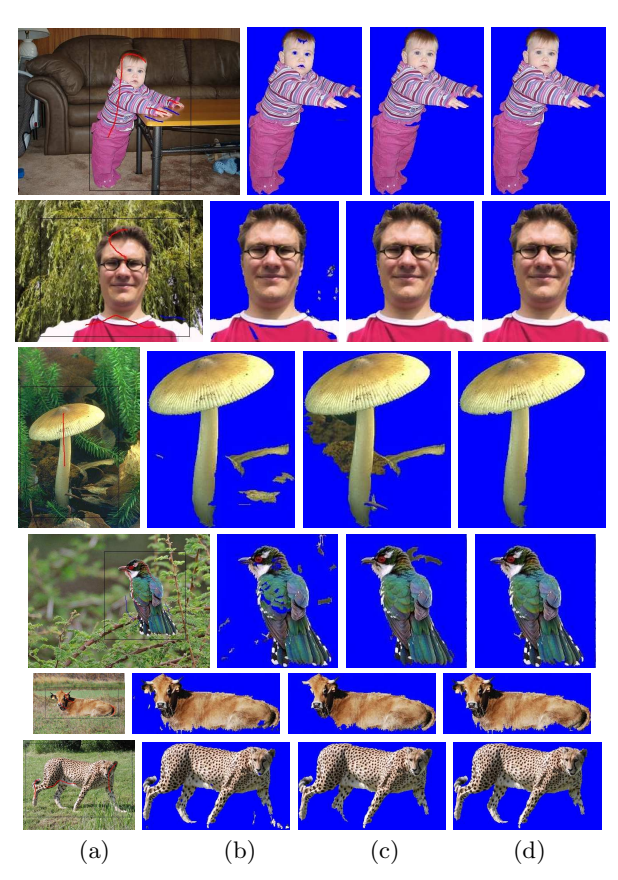
Figure 3: Comparisons between the graph-cuts over regions (GCR), the MSRM method [16] and the proposed algorithm. (a) The source images with user input stokes, where blue strokes are used to mark the background regions, and red strokes are used to mark the foreground regions. (b) Results obtained by the GCR method. (c) Results obtained by the MSRM method. (d) Results obtained by the proposed algorithm.