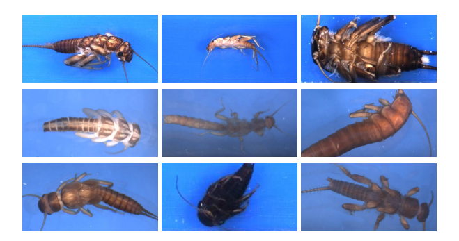
Figure 2. Example images of different stonefly larvae species in the STONEFLY9 dataset. From left-to-right and top-to-bottom: Cal, Dor, Hes, Iso, Mos, Pte, Swe, Yor and Zap. See [12] for the full species names.