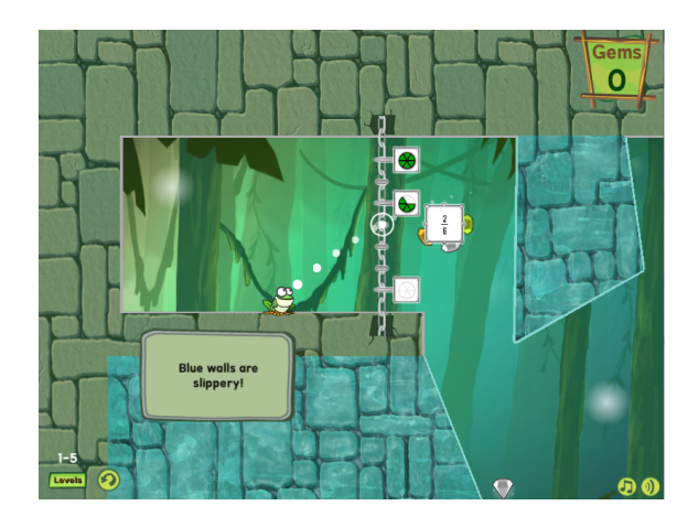
Figure 1: A screenshot of Treefrog Treasure, our source of users. Players navigate through a physics-based world, solving number line problems along the way. Notice that the number line has full tick marks, pie chart labels on the line, and a symbolic (ex. \frac{a}{b} ) target representation. In our experiment, these are a few of the parameters we allow our system to automatically explore to determine which types of number lines lead to maximal near-transfer.

Throughout this paper, we will be using data drawn from an experiment carried out in the educational game Treefrog Treasure, seen in Figure 1. We give out different types of number lines to players and study how accurately they an-