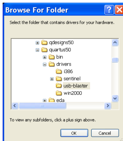
Figure 4. Browse to find the location.

Now, choose Search for the best driver in these locations and click Browse to get to the pop-up box in Figure 4. Find the desired driver, which is at location altera\quartus50\drivers\usb-blaster . Click OK and then upon returning to Figure 3 click Next . At this point the installation will commence, but a dialog box in Figure 5 will appear indicating that the driver has not passed the Windows Logo testing. Click Continue Anyway .