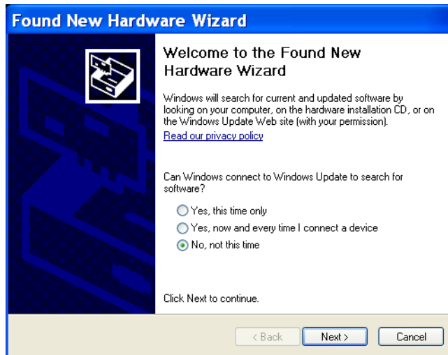
Figure 1. Found New Hardware Wizard.

Since the desired driver is not available on the Windows Update Web site, select No, not this time in response to the question asked and click Next. This leads to the window in Figure 2.