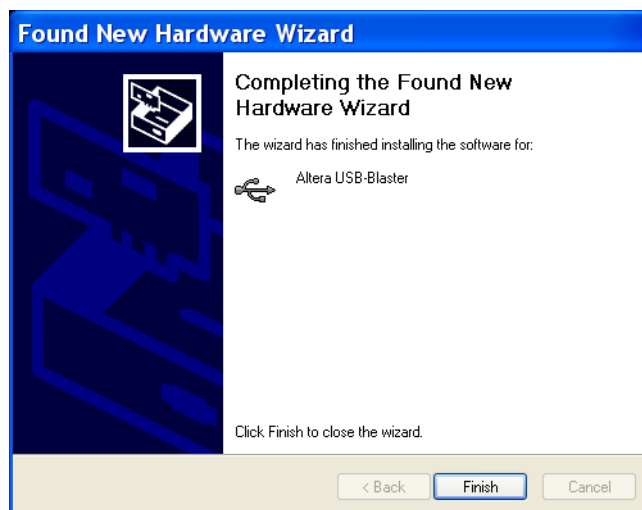
Figure 6. The driver is installed.

The driver will now be installed as indicated in Figure 6. Click Finish and you can start using the DE1 board.