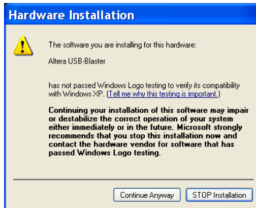
Figure 5. There is no need to test the driver.

The driver will now be installed as indicated in Figure 6. Click Finish and you can start using the DE1 board.