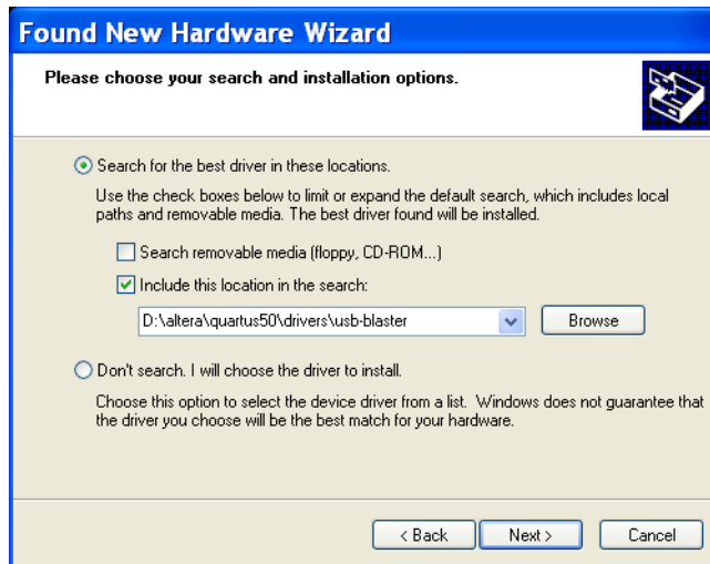
Figure 3. Specify the location of the driver.

Now, choose Search for the best driver in these locations and click Browse to get to the pop-up box in Figure 4. Find the desired driver, which is at location altera\quartus50\drivers\usb-blaster . Click OK and then upon returning to Figure 3 click Next . At this point the installation will commence, but a dialog box in Figure 5 will appear indicating that the driver has not passed the Windows Logo testing. Click Continue Anyway .